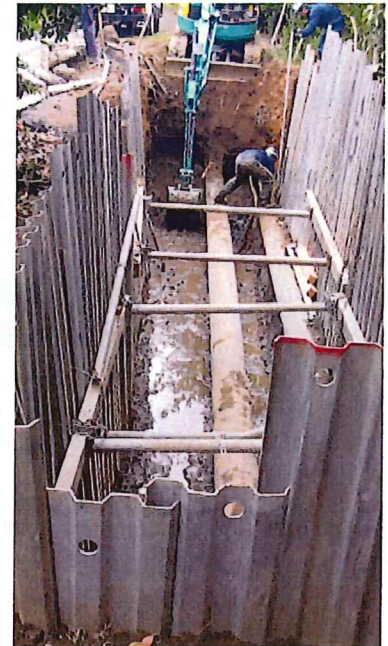
District piping network construction in July 2025

Although heat charges have remained unchanged since the commencement of heat supply services, we have concluded that a revision is necessary to ensure the continued safe and reliable operation of our facilities and to provide our customers with a stable heat supply with confidence. Accordingly, we have decided to apply for approval to revise heat charges and to update the presentation of basic charges in the price list. In addition, we will introduce the Raw Material and Fuel Cost Adjustment System (see reverse side for details).