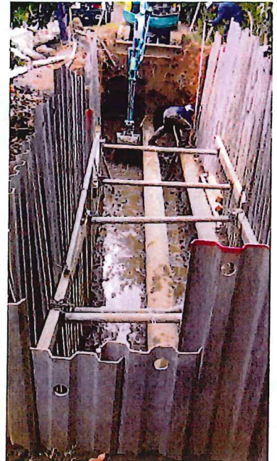
District piping network construction in July 2025

Although heat charges have remained unchanged since the commencement of heat supply services, we have concluded that a revision is necessary to ensure the continued safe and reliable operation of our facilities and to provide our customers with a stable heat supply with confidence. Accordingly, we have decided to apply for approval to revise heat charges and to update the presentation of basic charges in the price list. In addition, we will introduce the Raw Material and Fuel Cost Adjustment System (see reverse side for details).